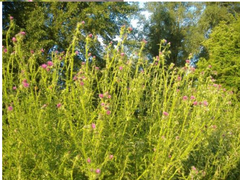
Welted thistle clump